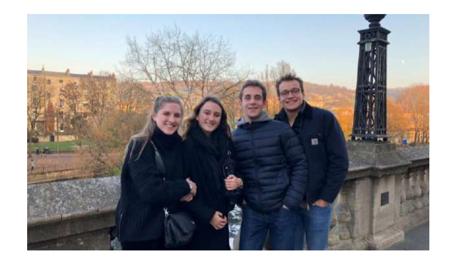
This was at Bath!!

Good luck to the Class of 2019 embarking on their international university adventure at Edinburgh University to study Environment & Sustainability, King's College London to study International Relations, ASAS Paris to study Law and Versailles to study Business.